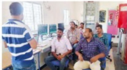
HERO FUTURE – GURUVEPALLI (ANDHRA PRADESH)