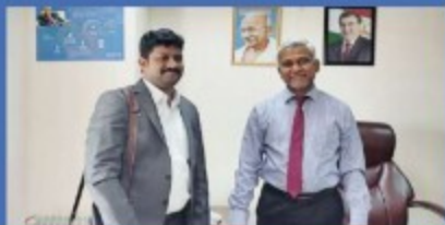
M/S. KALPATARI - UZBEKISTAN