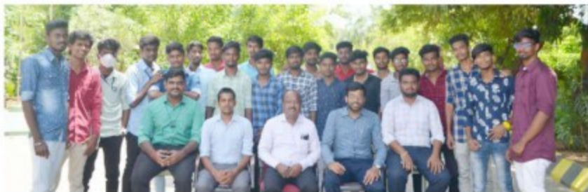
Government college of Engineering Bodinayakanur