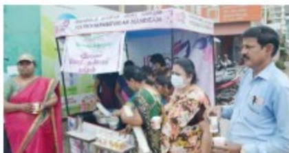
Our VMVM Heads serving spiced buttermilk