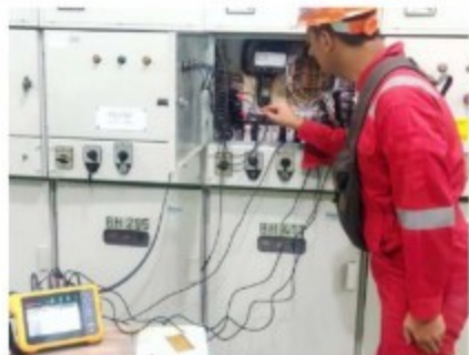
Harmonics Measurement at M/s. Power Engineering and Technology in Cilegon, Indonesia