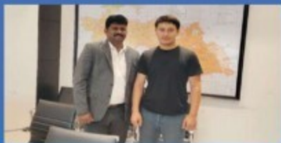
M/S. TGEM - TAJIKISTAN