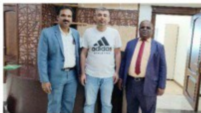
M/S. CALIX ENERJI – UZBEKISTAN