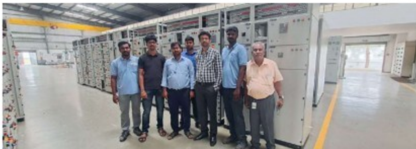
Successfully Completed Voltas RWSS - Puri & Sambalpur Project