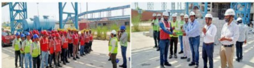
NTPC - DARLIPALI (ODISHA)