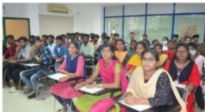
Theoretical class at kovur Training Center