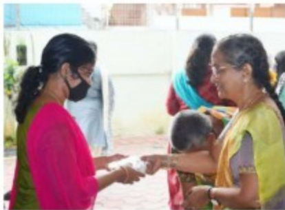
Distribution of Sweets to Employees