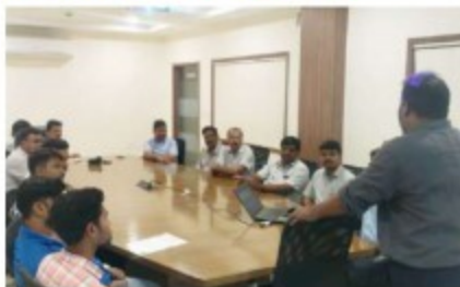
OH&S Training - M3 - CRP division - Bangalore