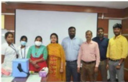
Successful Completion of the vaccination camp by our HR Team