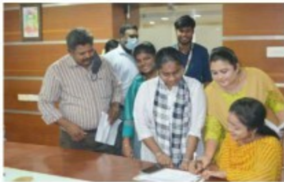
Employees registering for vaccine