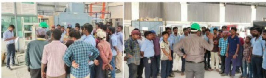
OH&S Training - M2 - Switchgear division - Cheyyar