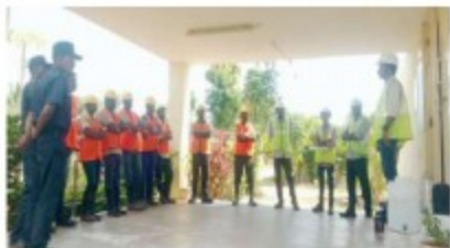
HERO FUTURE- PD KOTE (KARNATAKA)