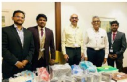
Presentation by our CEO about our Products and Services

We displayed our products and services in the INDO-AMERICAN CHAMBER OF COMMERCE Business Excellence Awards held on Friday, August 5, 2022 at Crowne Plaza Chennai Adyar Park, an IHG Hotel