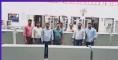
MEIL - Virudhunagar - TANTRANSCO Inspection