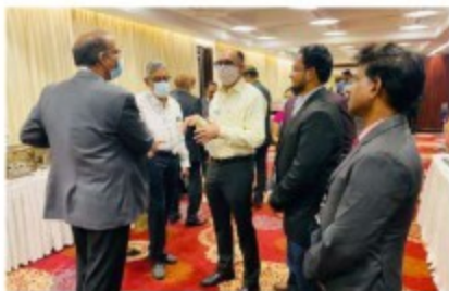
B2B Discussion of IACC Event