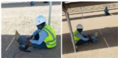
RED SEA SOLAR PROJECT