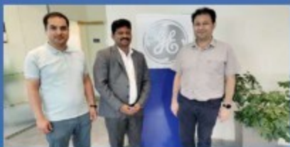
M/S. GE RENEWABLES