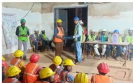
Motivational Program - Vedanda - Ianjigarh