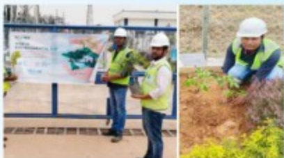
AMPLUS SOLAR- MIRZAPUR (UTTAR PRADESH)