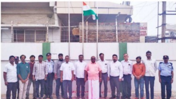
Employees gathered for the Flag Hoisting