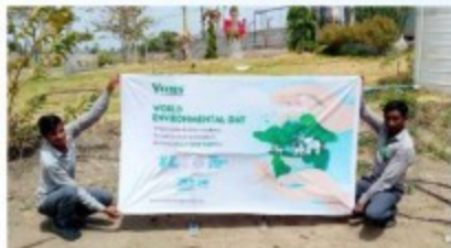
HERO FUTURE – RATLAM (MADHYA PRADESH)