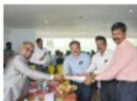
VEPL - IN1