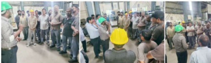
OH&S Training - M1 - Transformer division - Pillaipakam