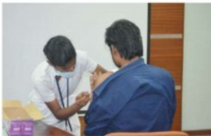
Vaccination to our employees