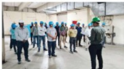
IEPL - NAGPUR