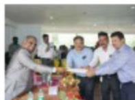
VEPL - IN2