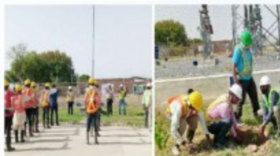
AMPLUS SOLAR – KHANAK (HARYANA)