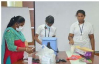
Setting up vaccination camp by Tamilnadu Health Corporation (Poonamalle)