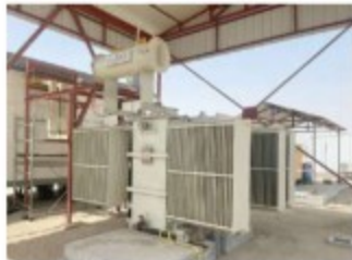
VMC Transformer - 11kV/440V, 3350 kVA supplied in Middle East (Kuwait) was successfully energised at Hot pad project - Wafra Joint Operations