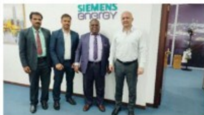
M/S. SIEMENS – UZBEKISTAN