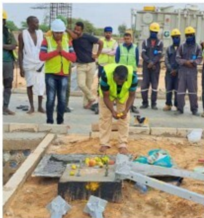
Inauguration of M/s. KPTL 225/33kv Beni-Nadji and Tiguent Sub station - Mauritania