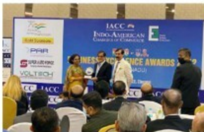
IACC Event Sponsored by Voltech Group