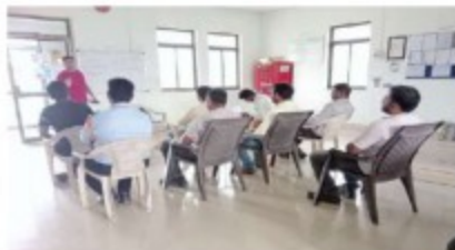
HERO FUTURE- SOUTHBUHD (MAHARASHTRA)