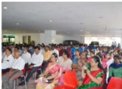
Employees assembled for the Pooja