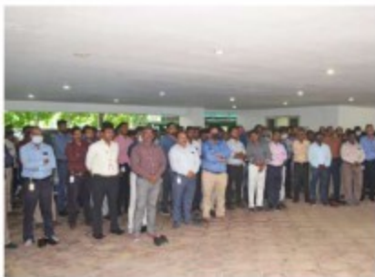
Employees assembled for the Pooja