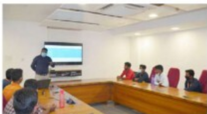
Safety class at Voltech H.O