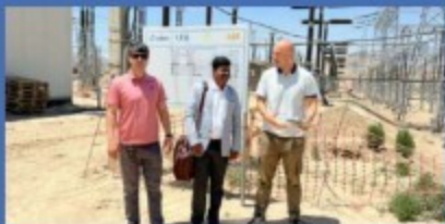
M/S. GRUPO COBRA