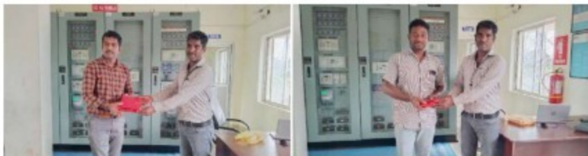
HERO FUTURE - ZAHEERABAD (TELANGANA)