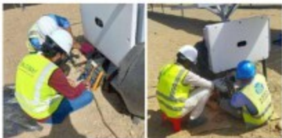
RED SEA SOLAR PROJECT