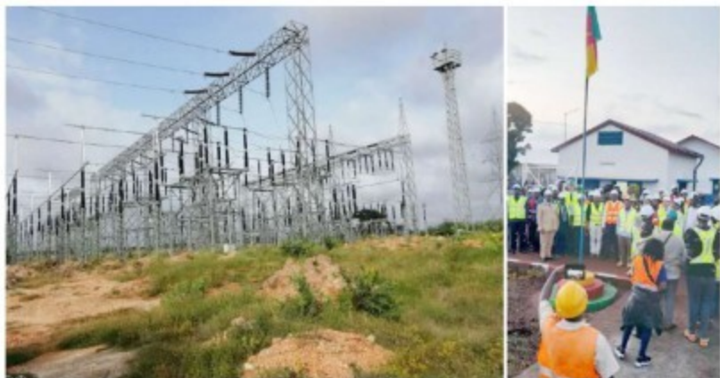
Installation, Testing & Commissioning of 5nos. of 225/90kV Substation in Cameroon