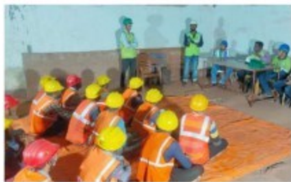
Motivational Program - Vedanda - Ianjigarh