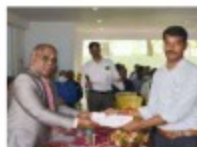
Voltech Group Accounts