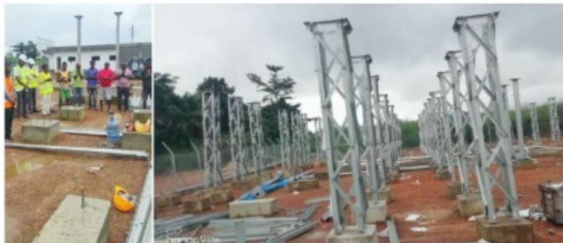
Installation, Testing & Commissioning of 4 nos of 66/33/11kV Substation in Sierra Leone