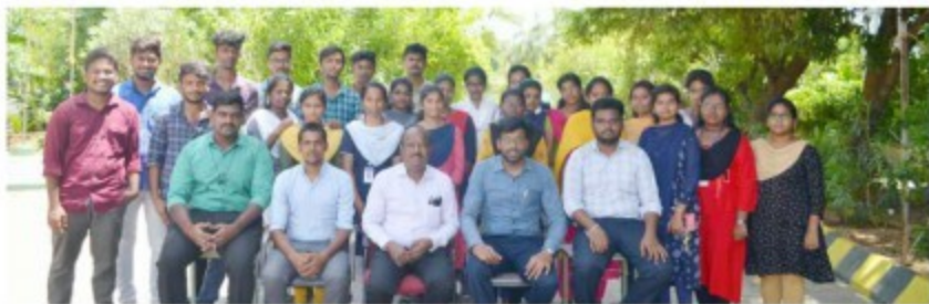
Government college of engineering Dharmapuri