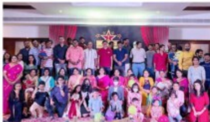
Asian paint's theme based event was conducted by Voltech HR Services on 9th JULY 2022 in Hotel GREEN PARK