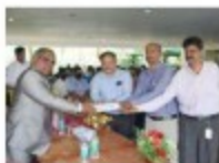
VEPL - IC - D1