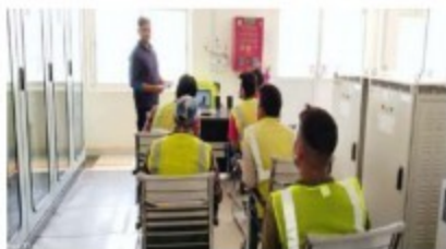
AMPLUS SOLAR (MIRZAPUR)