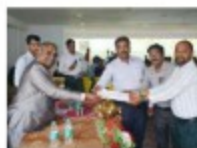
VOMS - O&amp;M - 2