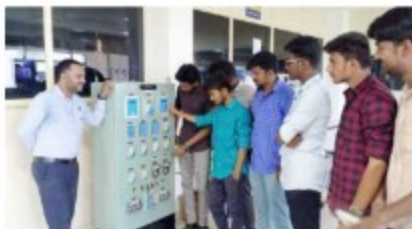
Battery charger factory visit