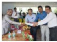
VEPL - IN3