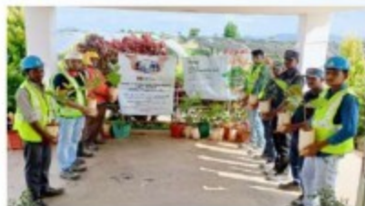
HERO FUTURE – KOLLEGAL (KARNATAKA)