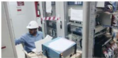
Commissioning work at 133/33kV SABB AL JARAH S/S