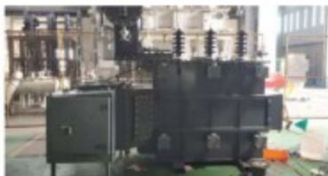
IMVA Voltech Make Transformer for M/s Huxley, Ivory Coast