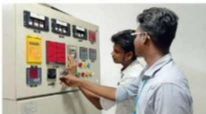
Switchgear factory visit