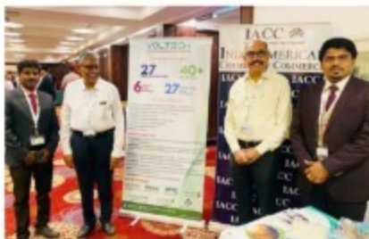
VIP's at Dias