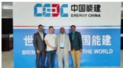
M/S. CGGC – UZBEKISTAN