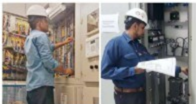
Commissioning work at 133/33kV SABB AL JARAH S/S