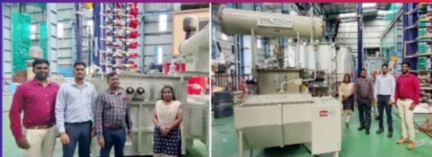
Successfully completed Inspection for M/s. VEPL - Vedanta Project - 2.5MVA/33/6.6KV Power Transformer.