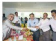
VEPL - ECS