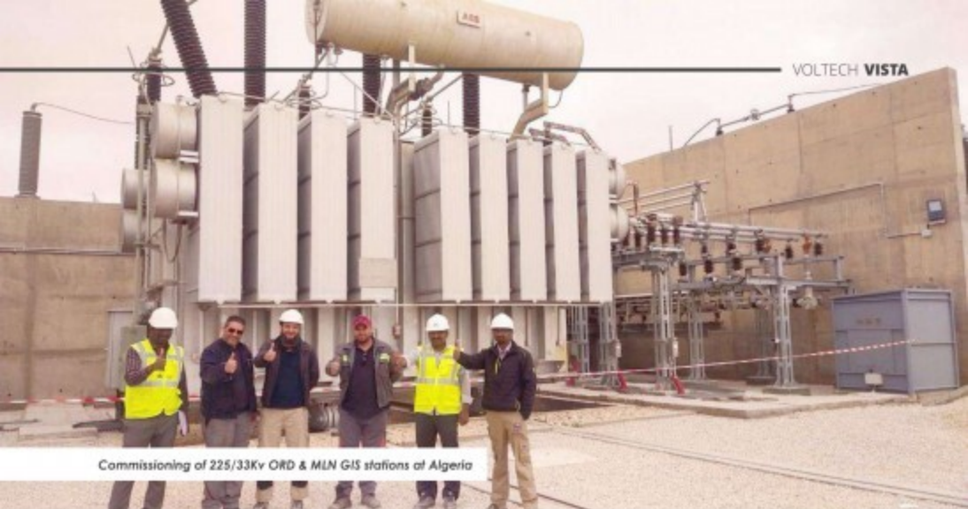
Commissioning of 225/33Kv ORD & MLN GIS stations at Algeria