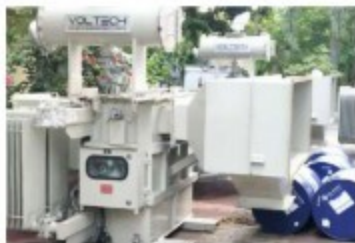
Successfully supplied 8 No's of Transformers to M/s. Siemens energy Ltd. , Thailand