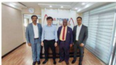
M/S. ACWA POWER – UZBEKISTAN