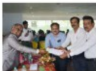
VEPL - IN5