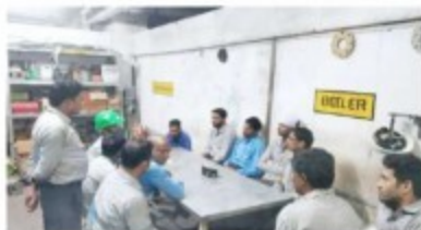
KSK- AKALTARA (CHATTISGARH)