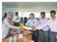
VEPL - IC - C5