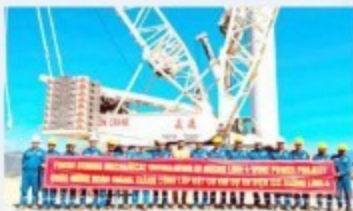
Our Wind turbine inspector at 50MW Huang Linh 4 Wind Project. Vietnam for M/s. TRACTEBEL ENGINEERING LIMITED