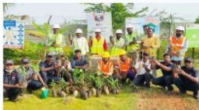
HERO FUTURE –PD KOTE (KARNATAKA)