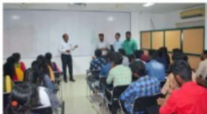
Theoretical class at kovur Training Center