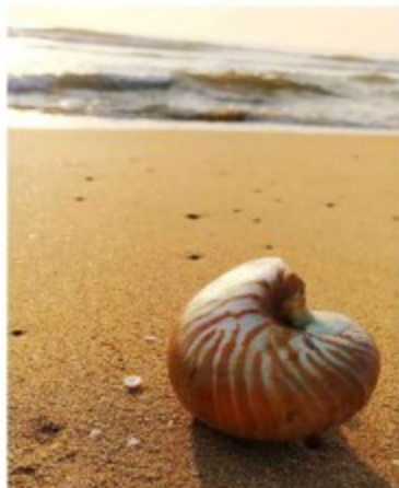
Photography by - Seenupandi T Sr.Executive HR