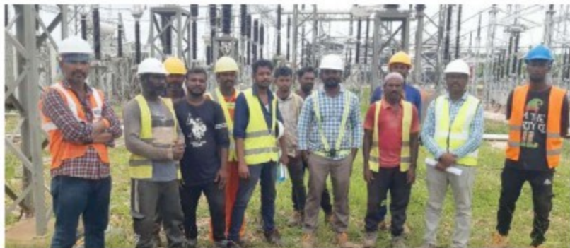
Inauguration of M/s. TATA 225kv Kodialani Sub station - Mali