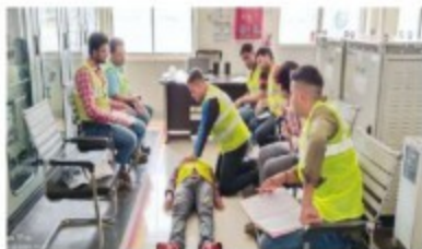
AMPLUS SOLAR- MIRZAPUR