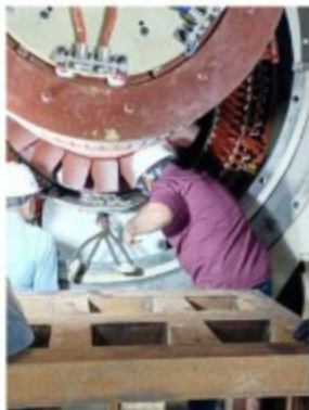
Diagnosis of Generator (rotor) fault at HPL, Haldia