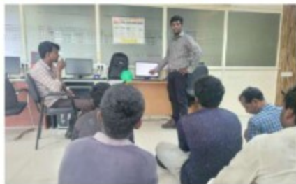
OH&S Training - Asia Power Electrical