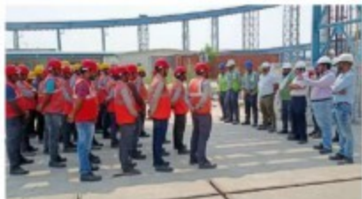
NTPC- DARLIPALLI (ODISHA)