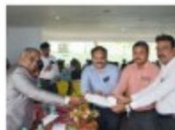
VEPL - IN6