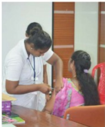
Vaccination to our employees

We take extreme pleasure and happiness on successfully completion of Vaccination Drive. We would like to congratulate all the team members of our organization for their assistance in successfully completion of Vaccination Drive.