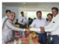
VOMS - O&amp;M - 3