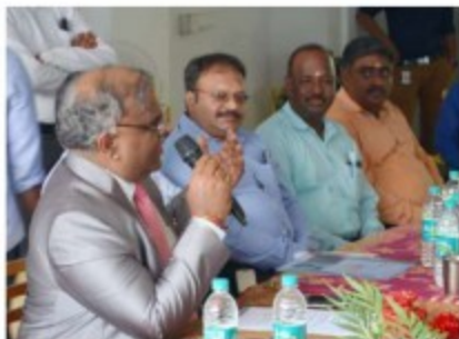
Employees assembled for the Pooja