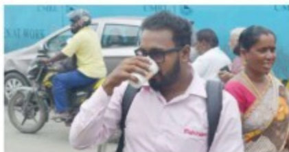
Passers-by quenching their thirst