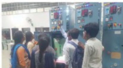
Switchgear factory visit