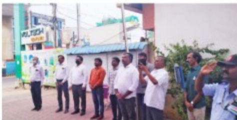
Voltech Team paying Homage to the tri-color

The Independence Day was celebrated with great enthusiasm by all the employees of Voltech group and winded up the celebration by singing National Anthem.