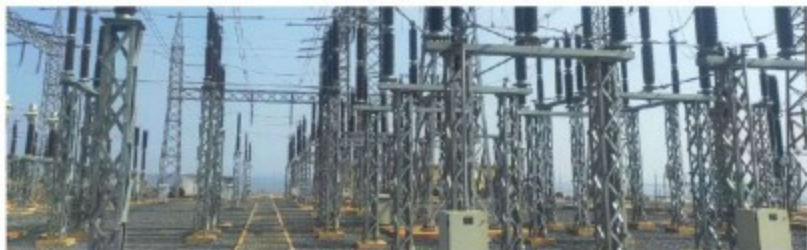
Testing & Commissioning of Hydro Power Plant's associated Substation in Rwanda