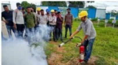
NTPC- DARUPALLI (ODISHA)