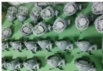
Successfully Supplied Flame proof products to PT.Sevu Jaya Utam