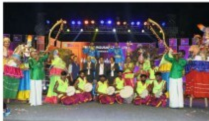
SBI EVENT was conducted on 19th JULY 2022 in LEO MUTHU INDOOR STADIUM