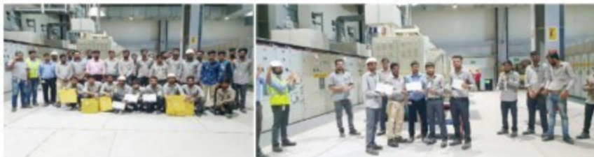
ADANI - MUNDRA (GUJARAT)