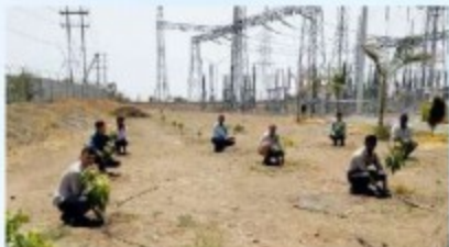
HERO FUTURE – RATLAM (MADHYA PRADESH)