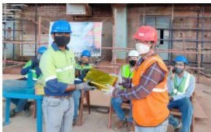
Motivational Program - Vedanda - Ianjigarh