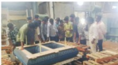
Transformer factory visit