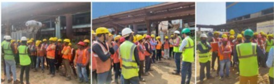
OHS Training - Vedanda - Ianjigarh