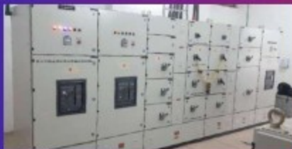
Successfully commissioned Crowne Plaza Project, Baashiyam Construction