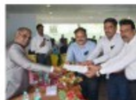
VEPL - IN4