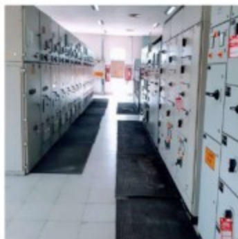
Control Room Building of Dalmia