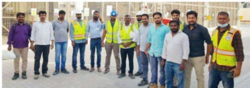
132/11kV MADINAT SEHA Substation in DEWA network UAE