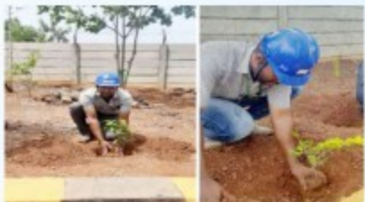
HERO FUTURE- ZAHEERABAD (TELANGANA)