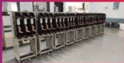
VCB Line Assembly