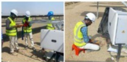
RED SEA SOLAR PROJECT