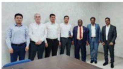
M/S. ENTER ENGINEERING - UZBEKISTAN