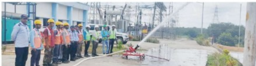
STERLITE – INDIGRID (TRIPURA)