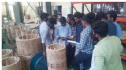
Transformer factory visit