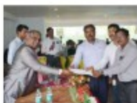
VOMS - O&amp;M - 1