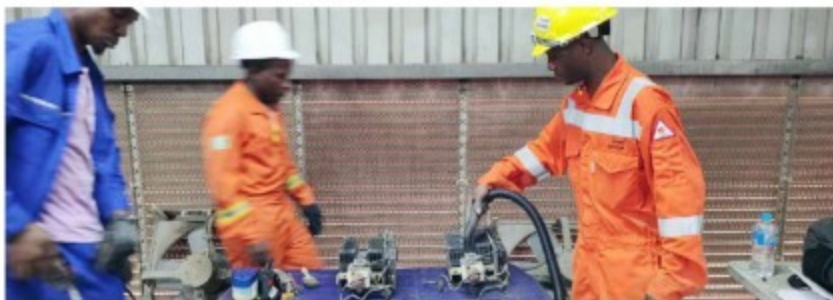
Retrofitting and Modification works at Notre Power plant in Nigeria