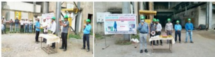
KSK - AKALTARA (CHATTISGARH)