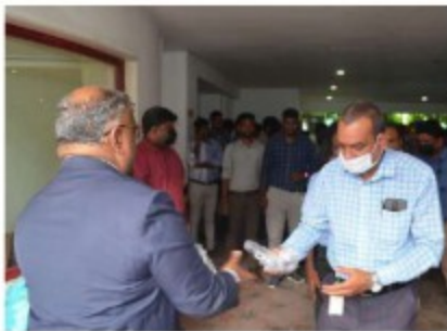
Distribution of Sweets to Employees