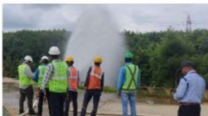
STERLITE – INDIGRID (TRIPURA)