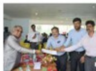
VEPL - IC - D2