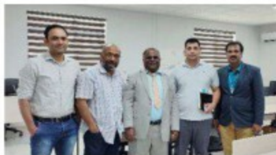
M/S. NOMAC – UZBEKISTAN