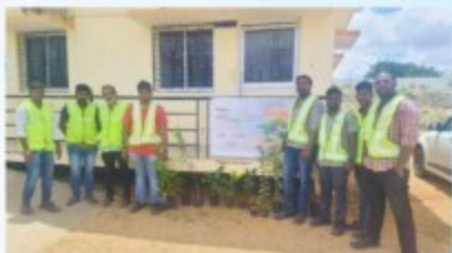
HERO FUTURE- GURUVEPALLI (ANDHRA PRADESH)