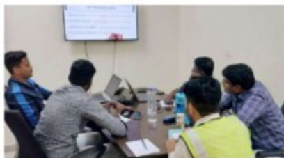
AMPLUS SOLAR- KHANAK (HARYANA)