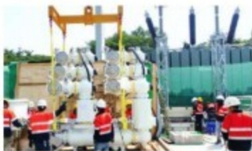
Our GIS Installation Engineer of Myanmar for M/s. GE Global Operation.