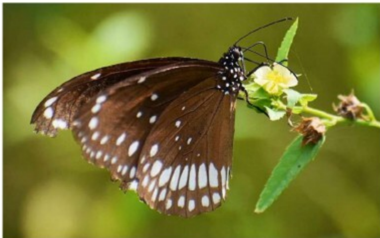
Photography by - Vishal Melvin Rex M Electrical Design Engineer - ICE