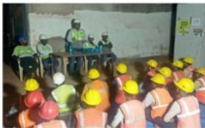
Motivational Program - Vedanda - Ianjigarh